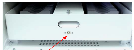
Firmware update port