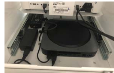
Mac Mini storage