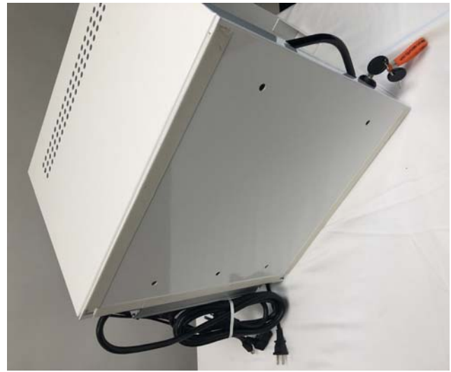
Table-top mounting/securing of the Riser (UniLock) can be accomplished in two ways.