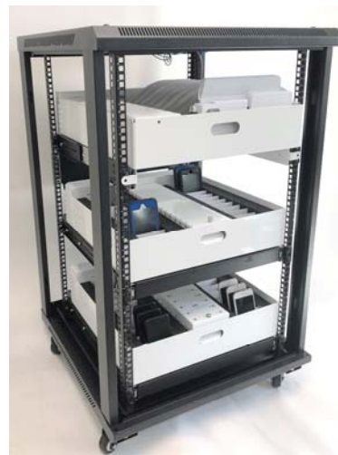
Doors and panels removed